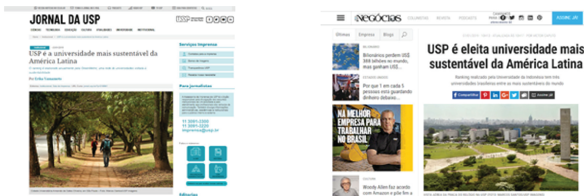
Figure 1 – Media highlights on USP's position in GreenMetric ranking 2018

USP is the 23rd most sustainable university in the world, being the best positioned Latin American institution, according to the GreenMetric ranking 2018, a global network that brings together universities from across the globe to discuss projects focused on environmental sustainability (see Figure 1). In all, 719 institutions from 81 countries were evaluated by the ranking, being 64 universities in Latin America.